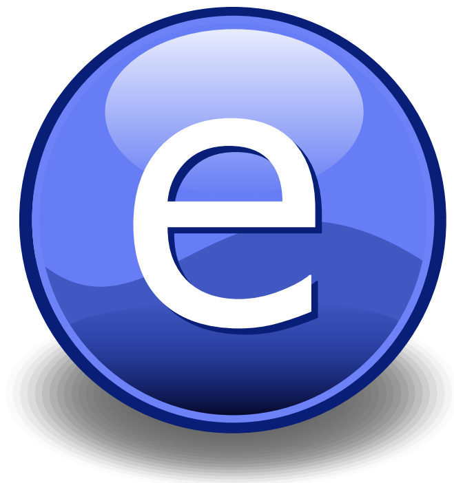
FIGURE 2.2: An electron (artist's impression).